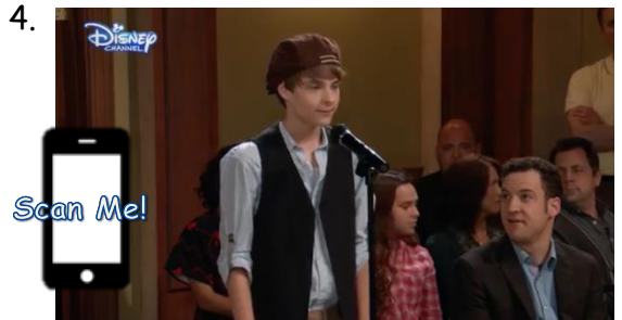
Girl Meets World