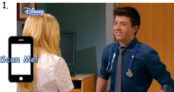
I Didn't Do It

The Disney Channel has many TV shows and they're very popular among junior high school students. Here're some ideas to help your group to think of an interesting drama.