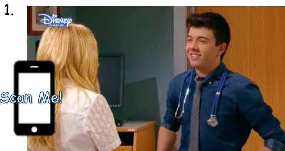
I Didn't Do It

The Disney Channel has many TV shows and they're very popular among junior high school students. Here're some ideas to help your group to think of an interesting drama.