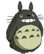
( Totoro )