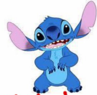
( Stitch )