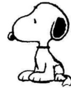
( Snoopy )