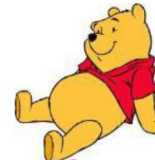
( Winnie the Pooh )